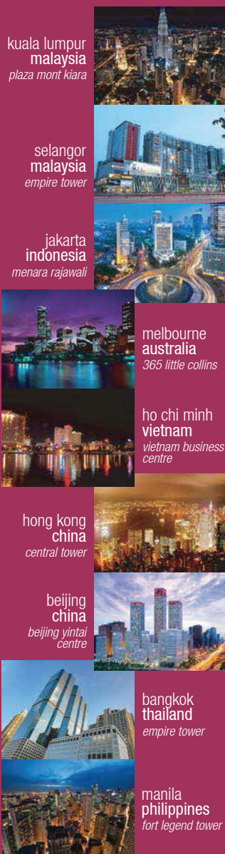
kuala lumpur malaysia plaza mont kiara

Prestigious Kuala Lumpur Address Level 7-1 Wisma Genting (New Wing) Jalan Sultan Ismail, 50250 Kuala Lumpur